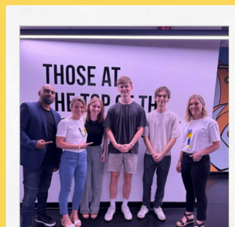
Grant Recipients & Judges

For student seeking funding to launch their ventures, we provide introductions to investors and access to funding networks. Subject to availability, select students will also be invited to pitch for up to $10,000 of equity-free funding through the Lotterywest Idea Starter grant program.